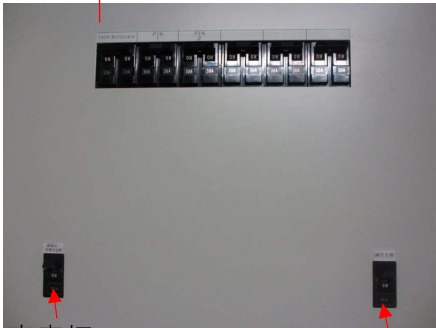
客席灯 作業灯主幹 (100A)